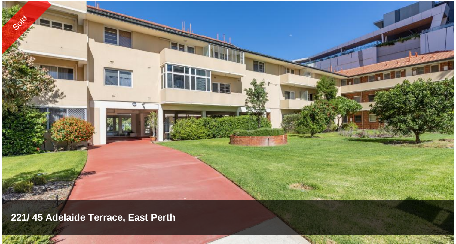
221/ 45 Adelaide Terrace, East Perth